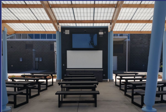
Exterior and Interior Views of Greenhouse